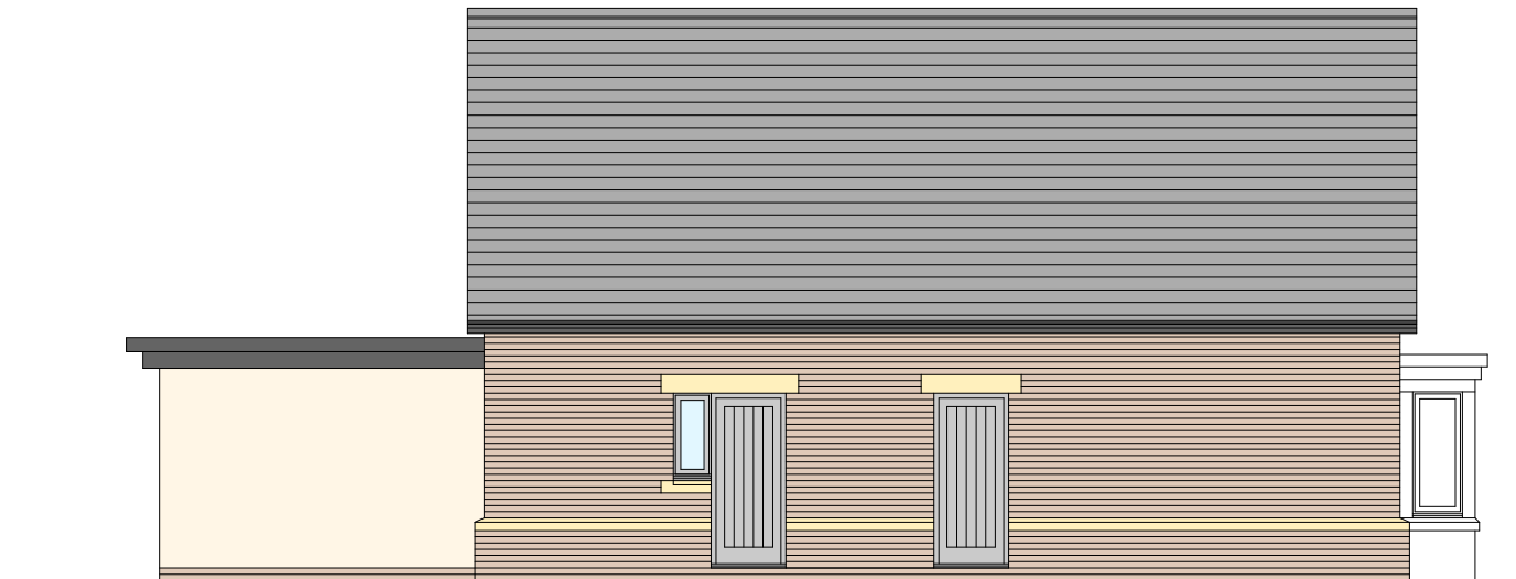
Proposed West Elevation (scale 1:100@A3)

REV 'C' REDRAWN TO SUIT LPA COMMENTS 22-09-23 REV 'B' REDRAWN TO SUIT LPA COMMENTS 24-07-23 REV 'A' POST REMOVED R.H.S. OF ENTRANCE CANOPY 30-06-23 & BIFOLDS ADDED TO SIDE OF FAMILY ROOM