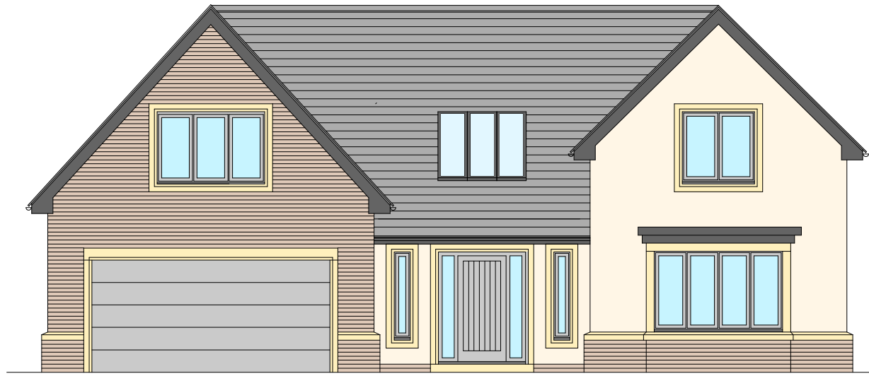
Proposed South Elevation (scale 1:100@A3)